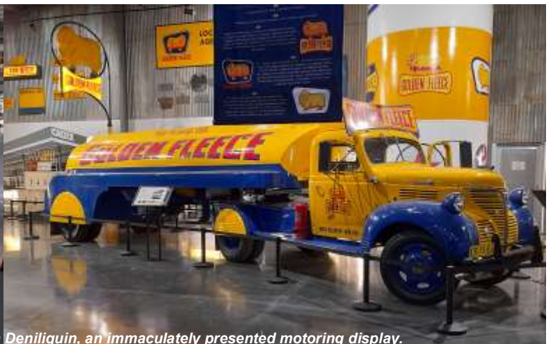
Day 3 included a stop at The Depot in Deniliquin, an immaculately presented motoring display.