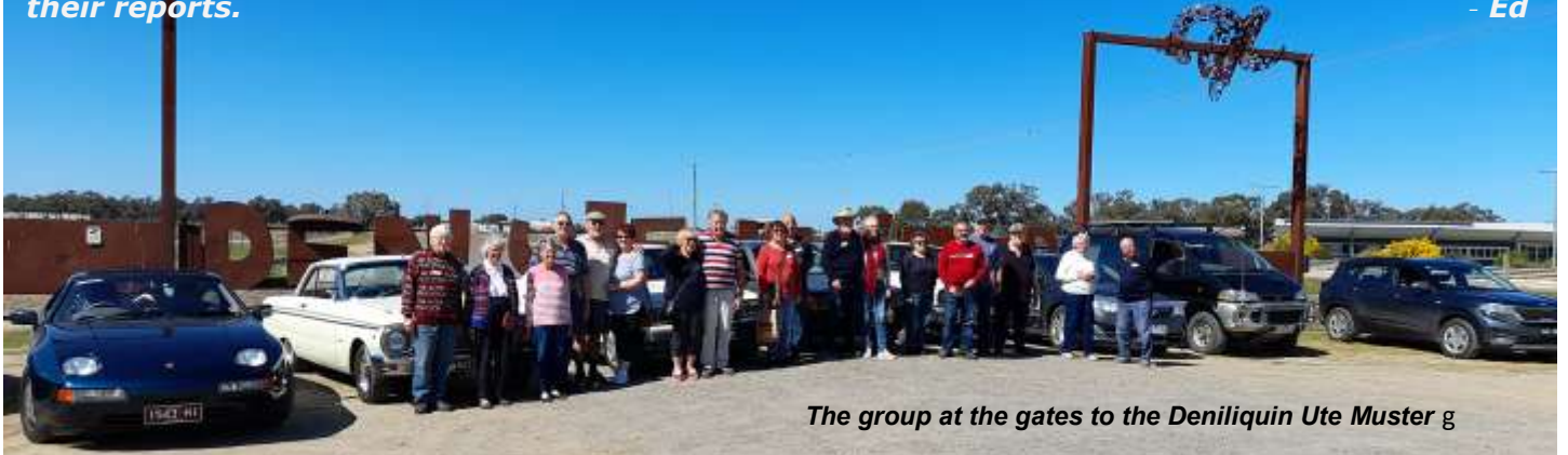
The group at the gates to the Deniliquin Ute Muster g