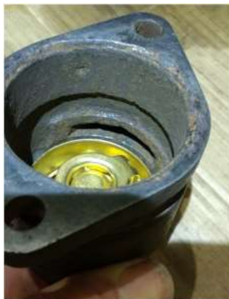
Cold thermostat showing the bypass part fully open. As the thermostat opens the shutter will begin to obscure the bypass port. When the thermostat is fully open the bypass is closed.

For the full story click the July tab at Riley Club of Queensland magazine - Riley Motor Club of Queensland (rileymotorclubqld.org.au) . - Ed)